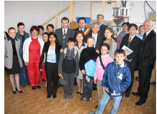
Closing ceremony at the Seed packaging unit, Valcele in presence of high officials and media

UNDP and Government of Japan (JWIDF) have officially concluded the project in “SC Vicora Femina SRL” in Floroaica village, one of the four pilot sites that were successfully implemented. Some of the units are currently running their own business on a self-sustainable basis without the external support of UNDP now. It is an excellent role model for rural women and other institutions to replicate the project further.