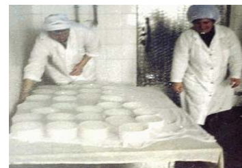
Vegetable Processing Unit, Buzau; Bakery, Giurgiu; Milk Processing Unit, Vaslui